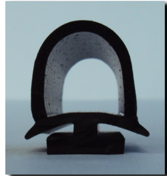
Double Loop Gasket – A Type